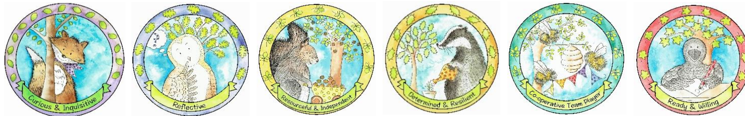
The Rainow Learning Values

Each week, a P4C trained teacher delivers a philosophy session to the children. P4C gives the children further opportunities to explore ideas and to practise articulating their own feelings and beliefs.