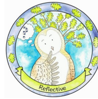
Oakley the Owl