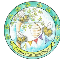
The Busy Bees