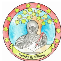
Rowan the Raven