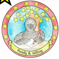
Rowan the Raven