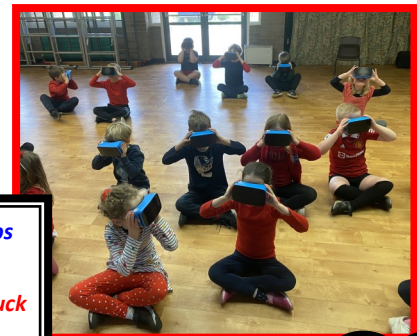
Centre and Left: Alice in Wonderland workshops proved a great success.