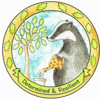
Bramble the Badger