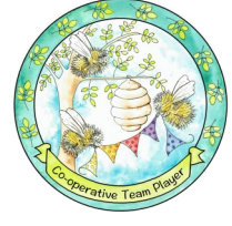
The Busy Bees