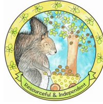
Speedwell the Squirrel