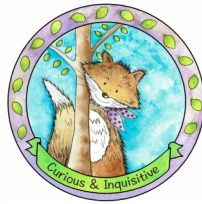
Fern the Fox