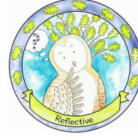
Oakley the Owl