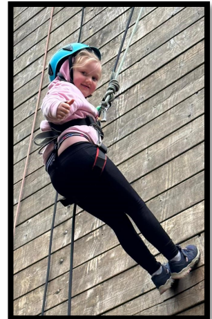
Above: Y3 & Y4s showing great courage, determination and independence.