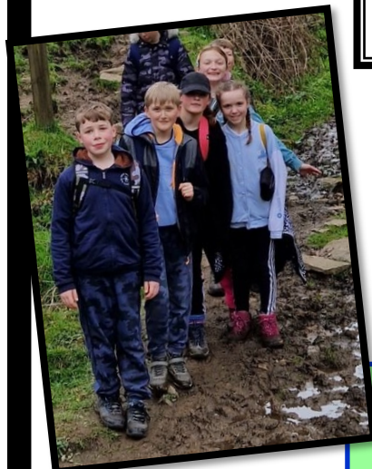
Below: Our children love learning outdoors (and hot chocolate!).