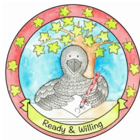
Rowan the Raven