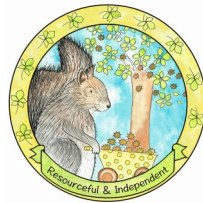
Speedwell the Squirrel