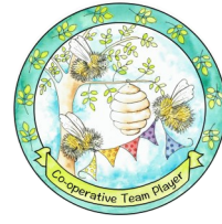
The Busy Bees