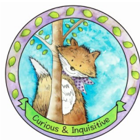
Fern the Fox