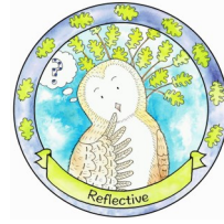
Oakley the Owl