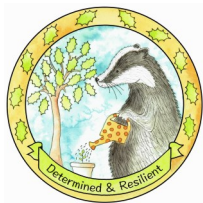
Bramble the Badger