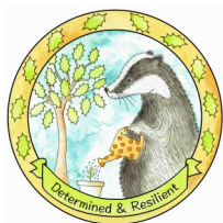
Bramble the Badger