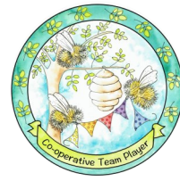
The Busy Bees