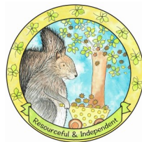
Speedwell the Squirrel