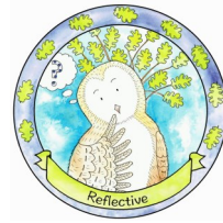
Oakley the Owl