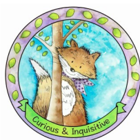
Fern the Fox