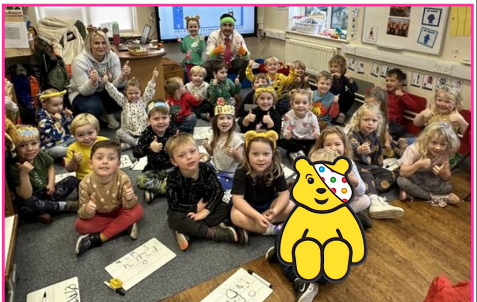
Left: Y4 wrote some emotion poetry around the idea of kindness and love: definitely anti-bullying! Right: The Reception Class enjoyed their first Rainow Children in Need day.