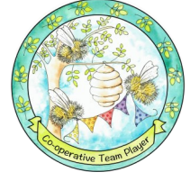
The Busy Bees