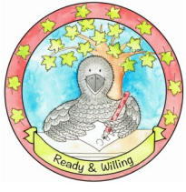
Rowan the Raven