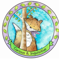
Fern the Fox