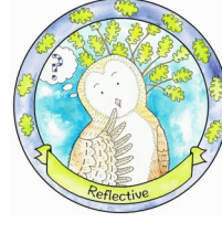
Oakley the Owl