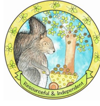
Speedwell the Squirrel