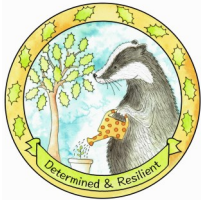
Bramble the Badger