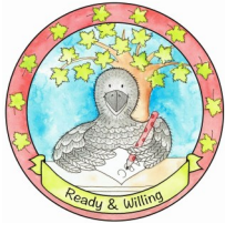
Rowan the Raven