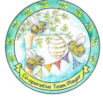
The Busy Bees