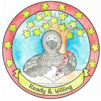
Rowan the Raven