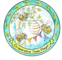
The Busy Bees