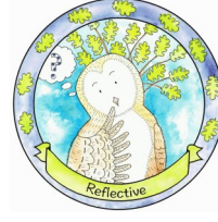
Oakley the Owl