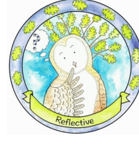
Oakley the Owl