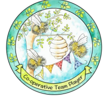
The Busy Bees