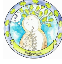
Oakley the Owl