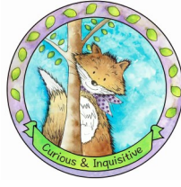
Fern the Fox