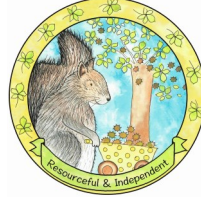
Speedwell the Squirrel