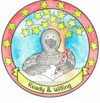
Rowan the Raven