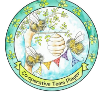
The Busy Bees