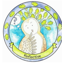
Oakley the Owl