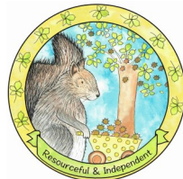
Speedwell the Squirrel