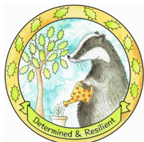
Bramble the Badger