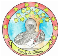
Rowan the Raven