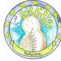
Oakley the Owl