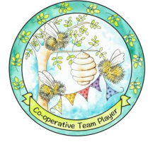
The Busy Bees