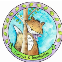
Fern the Fox