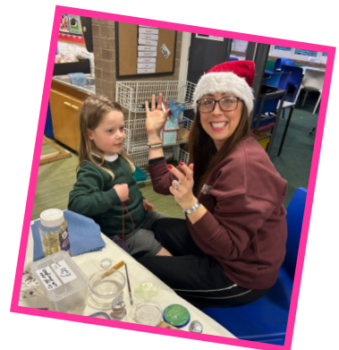
Rainow – An Exceptional School Community It's beginning to feel lot like Christmas!