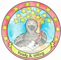
Rowan the Raven