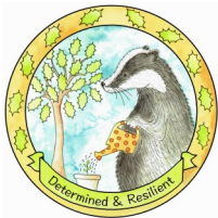
Bramble the Badger