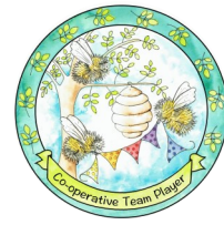
The Busy Bees