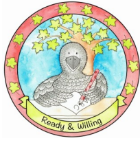
Rowan the Raven