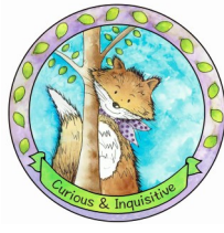
Fern the Fox