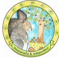
Speedwell the Squirrel