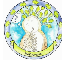
Oakley the Owl